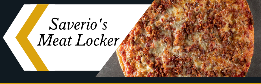
Saverio's Meat Locker