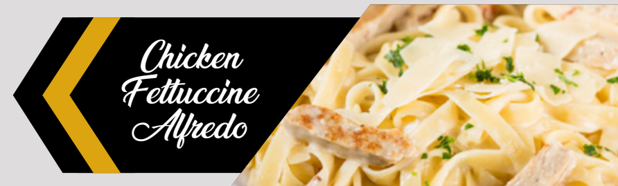
Chicken Fettuccine Alfredo