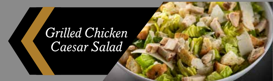
Grilled Chicken Caesar Salad