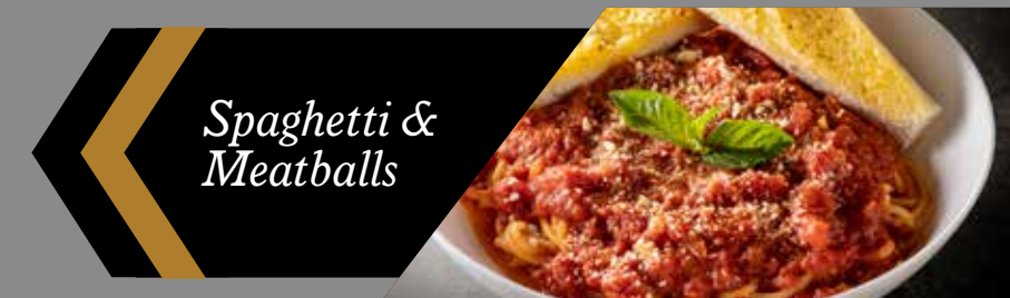
Spaghetti & Meatballs

Add 2 Meatballs or 1 Sausage Additional - $1.99